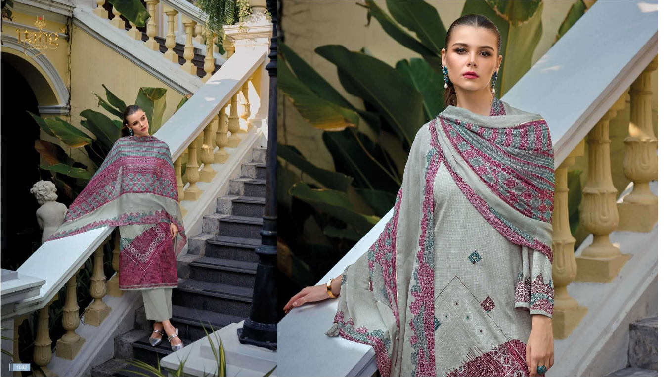
PLAYING DRESS-UP BEGINS AT AGE FIVE AND NEVER TRULY ENDS