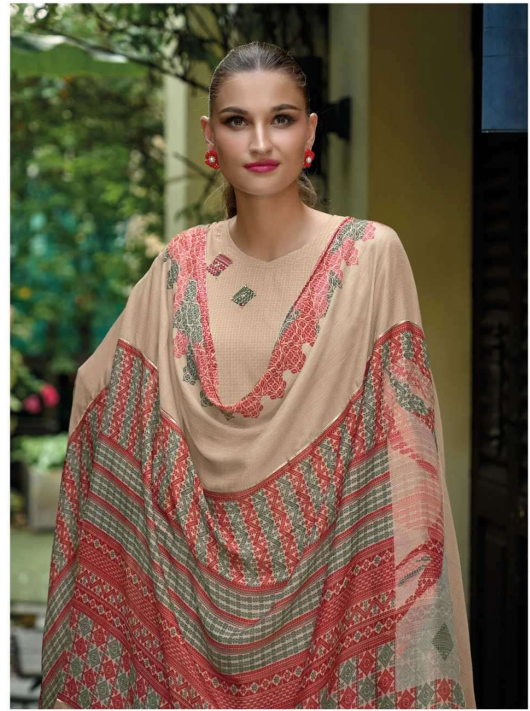
FASHION IS WHAT YOU BUY, STYLE IS WHAT YOU DO WITH IT