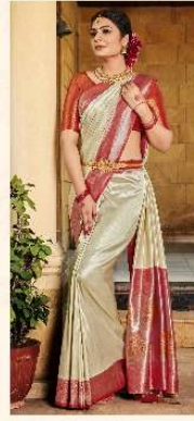
| 5104 |