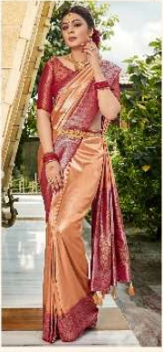
| 5101 |