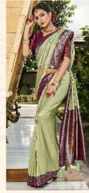
| 5105 |