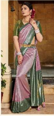
| 5103 |