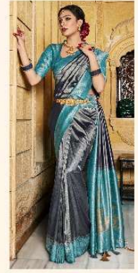
| 5106 |