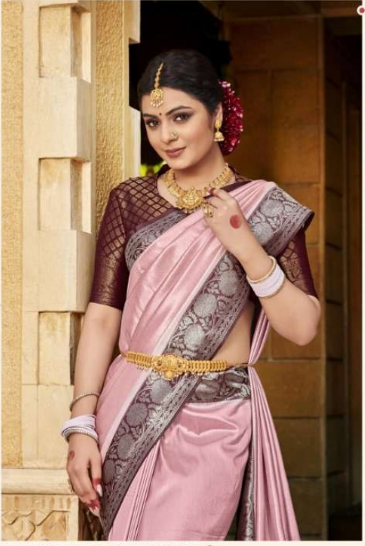
Full of tradition yet stylish | SMILE YOU'RE BEAUTIFUL