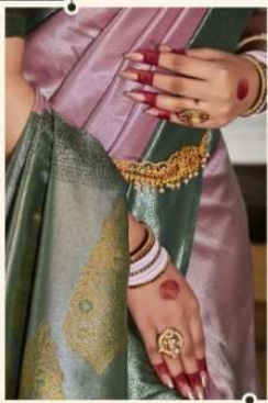
5103 the new simplicity | ULTIMATE COLLECTION