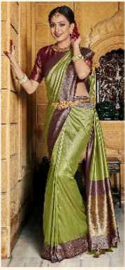
| 5108 |