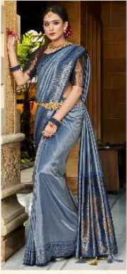
| 5102 |