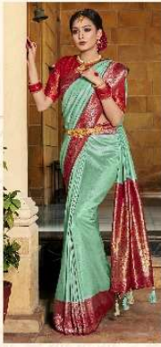
| 5109 |