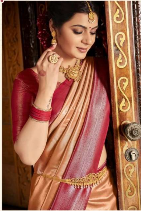
5101 more with the "trend" | HOW BEAUTIFUL IS THAT!