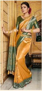
| 5107 |