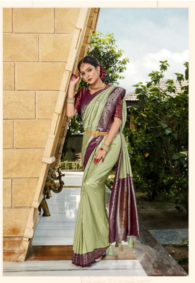
Handwoven silk saree