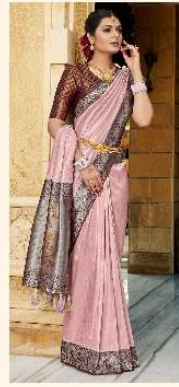
| 5110 |