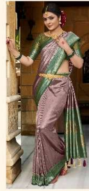
| 5111 |