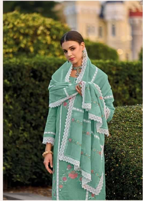
LUXURY IS THE EASE OF A T-SHIRT IN A VERY EXPENSIVE DRESS ●●●