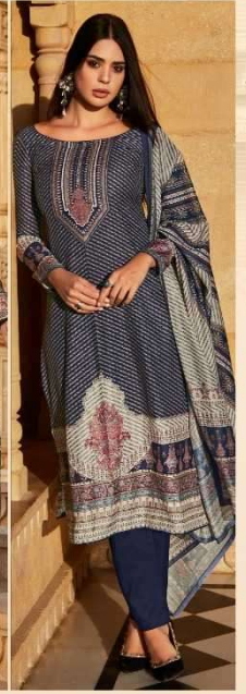
◆ 1006 ◆