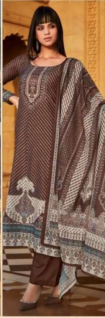
◆ 1002 ◆