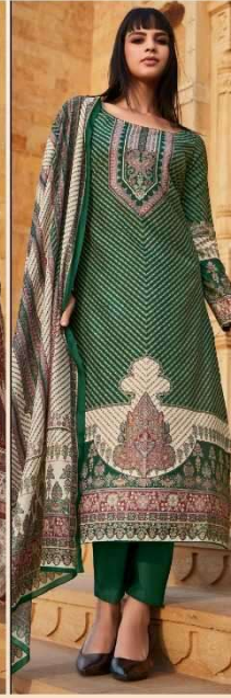
◆ 1005 ◆