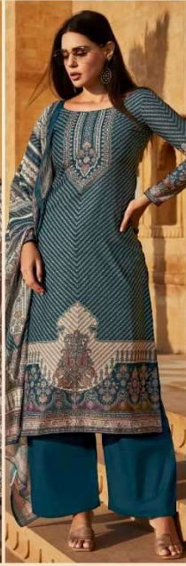
◆ 1003 ◆