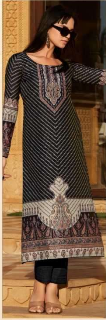
◆ 1001 ◆