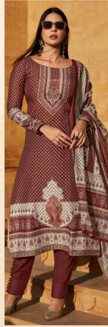
◆ 1004 ◆