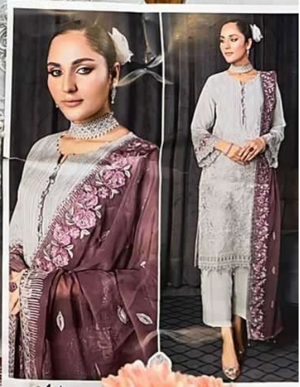
Aylene Faux Georgette with Embroidery TOP No. 10269 DUPATTI