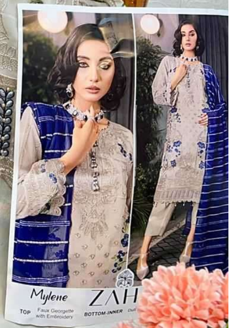
Mylene ZAH TOP Faux Georgette with Embroidery BOTTOM INNER Duple