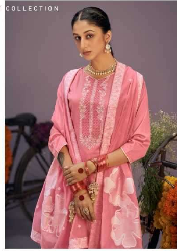
Casual yourself with an embroidered collection crafted with the finest materials and infused with delicate grace.