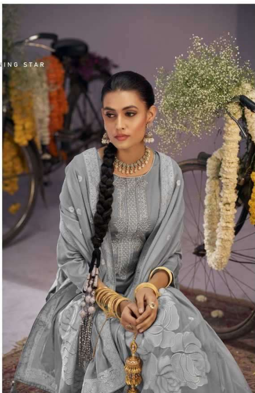
Her sari, the evening star, she shines first she shines brightest, and she shines longest