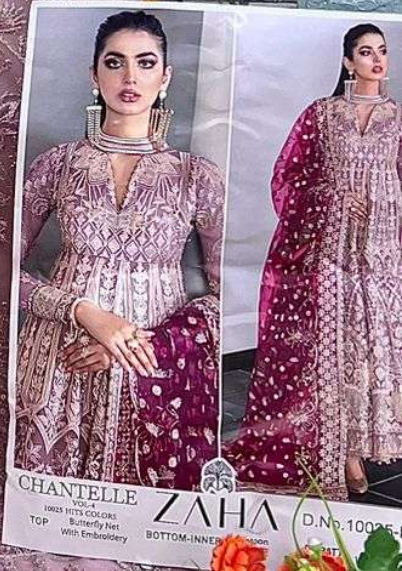
CHANIELLE VOL. 4 10025 1173 230-081 TOP With Embroidery ZAHA BOTTOM-INNER D.No. 10025-1