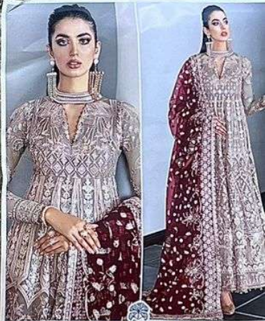
CHANTELLE ZAHA D.No.10025-D 100% NETS COTTON, Butterfly Net With Embroidery BOTTOM-INNER: Satin D. No. 10025-D (Dress by Anam) (Dress by Anam) With Embroidery