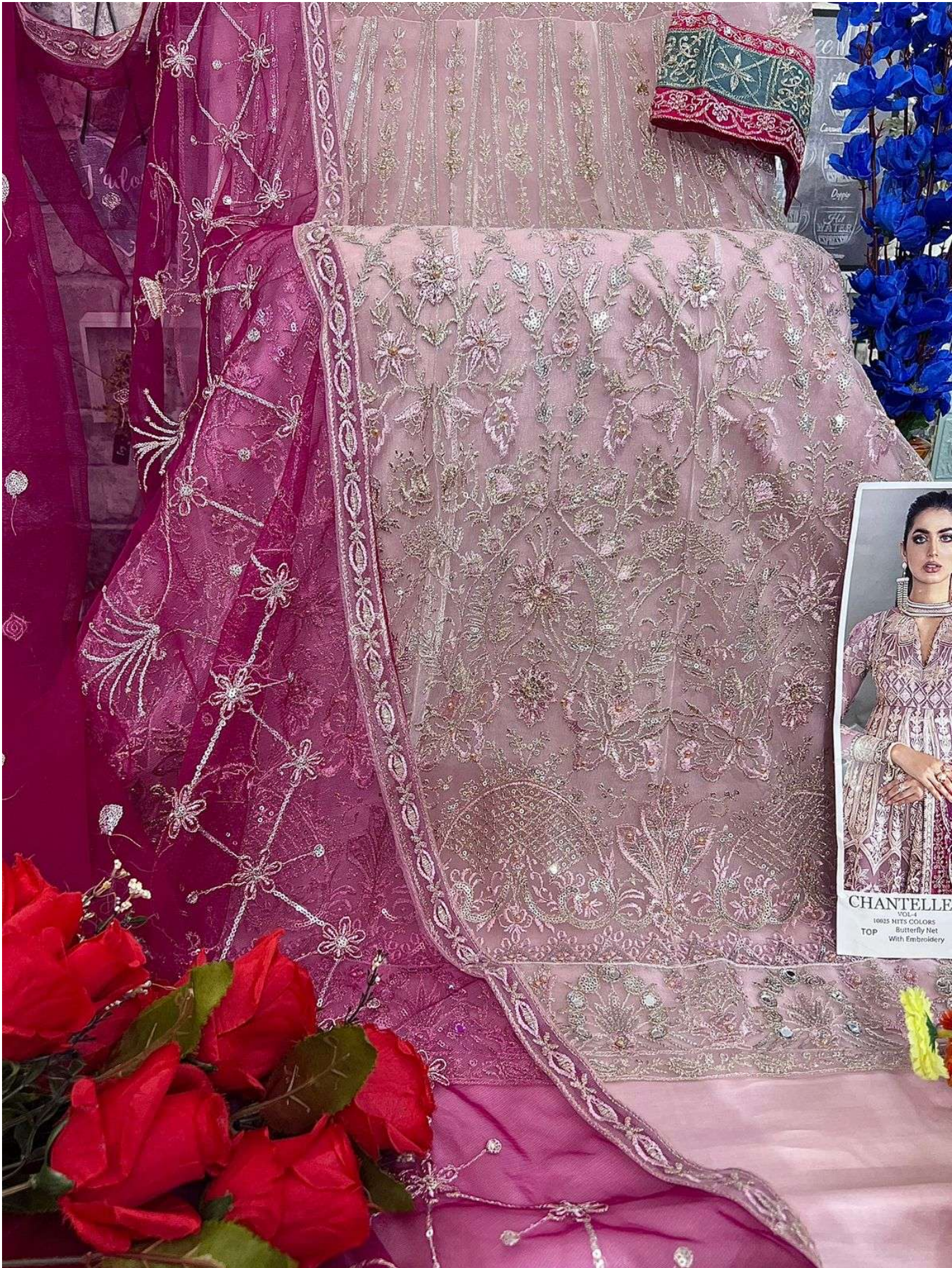
CHANTELLE VOL. 4 10025 NITS COLORS Butterfly Net TOP With Embroidery