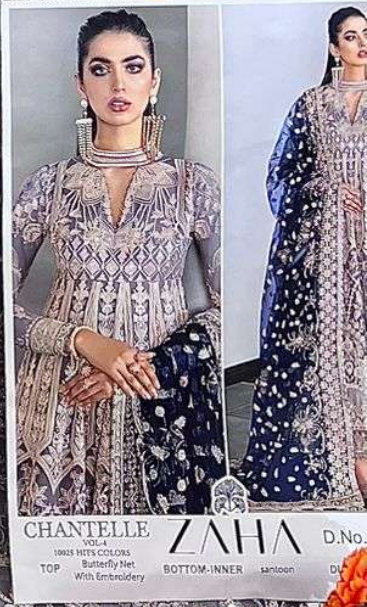
CHANTELLE VOL. 4 D.No. 10005 10005 HITE'S COLORS Butterfly Net With Embroidery ZAHA BOTTOM-INNER saritoon