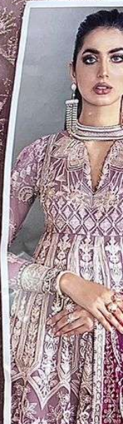
CHANTELLE VOL. 4 10025 NITS COLORS Butterfly Net TOP With Embroidery