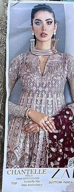
CHANTELLE ZAI 10025 1172 COLORS TOP Butterfly Net With Embroidery BOTTOM-INNER