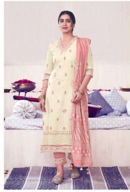
LOOK | 8982