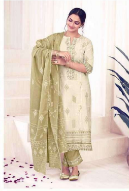
LOOK | 8984