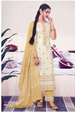
LOOK | 8981