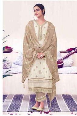
LOOK | 8986