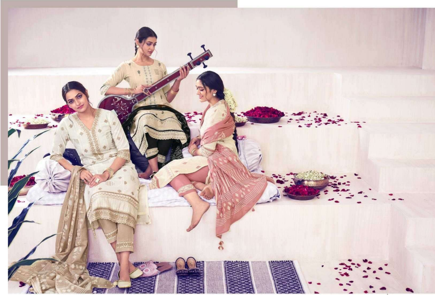
Traditional textiles & colors & silhouettes that have inspired trends around the world