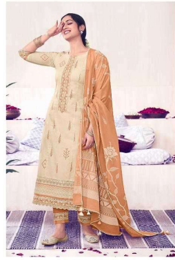
LOOK | 8985