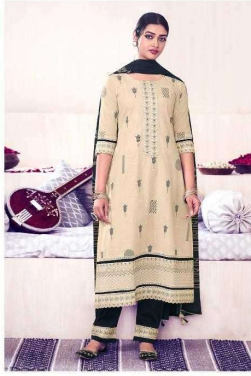
LOOK | 8983