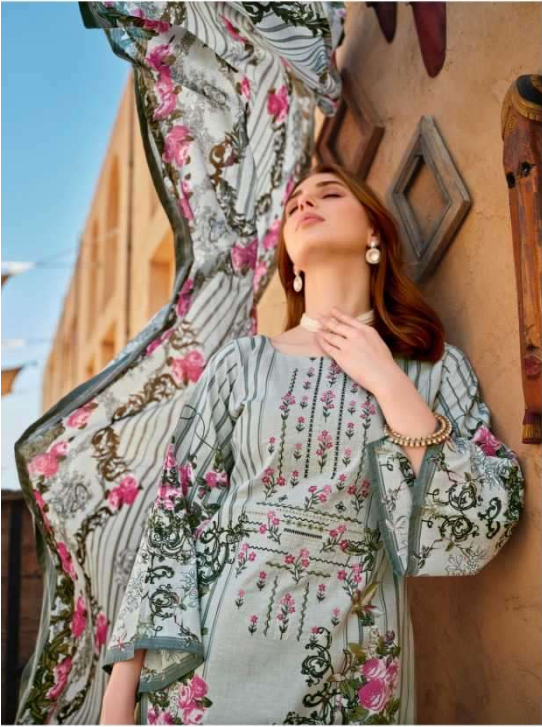
◆◆ // 891-001 "Style is something each of us already has, all we need to do is find it."