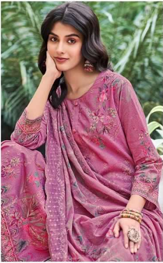
COLLECTION 2023-24 Stylal 3003