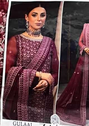
GULAAL Vol-4 TOP Faux Georgette with Embroidery (Cut-2.5 Mtr.) ZAHA D.No BOTTOM-INNER Dull Santoon (Cut-4 20 Mtr.) DUPA