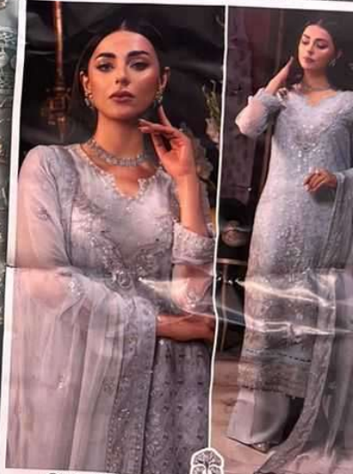
GULAAL Vol-4 TOP Faux Georgette with Embroidery (Cut-2.5 Mir.) ZAHA BOTTOM-INNER Dull Satin (Cut-4-20 M) D.No. 10 DUPATT