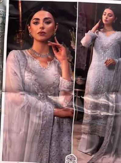
GULAAL Vol-4 TOP Faux Georgette with Embroidery (Cut-2.5 Mir.) ZAHA BOTTOM-INNER Dull Satin (Cut-4-20 M) D.No. 10 DUPATTA