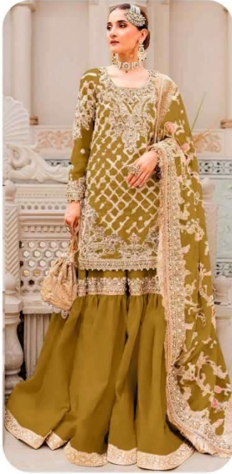
D.No 241 A