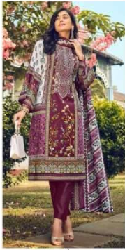
D.NO / 887-007