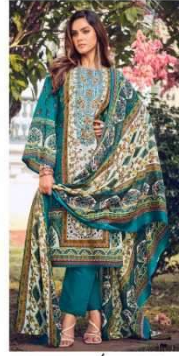
D.NO / 887-004