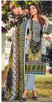
D.NO / 887-008