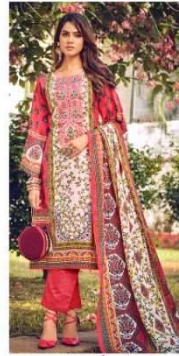
D.NO / 887-009