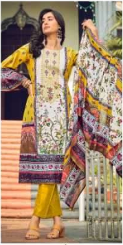
D.NO / 887-006