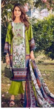
D.NO / 887-002