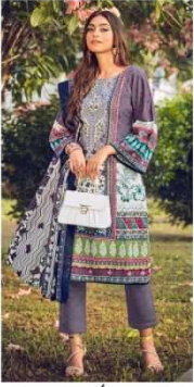
D.NO / 887-001