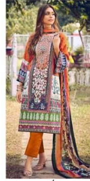
D.NO / 887-005