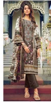
D.NO / 887-010