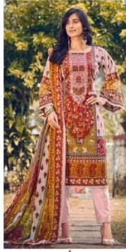
D.NO / 887-003