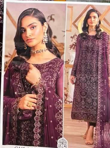
GULAAL Vol-3 TOP Faux Georgette with Embroidery ZAHA BOTTOM-INNER Dull Santoon DUPATTI Na D.No. 1021