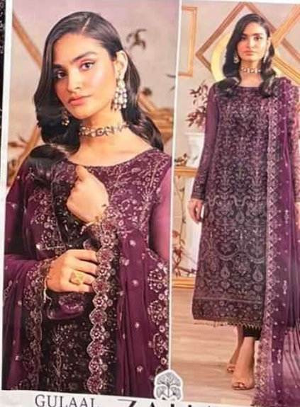
GULAAL Vol-3 TOP Faux Georgette with Embroidery ZAHA BOTTOM-INNER Dull Santoon DUPATT Na D.No. 1021