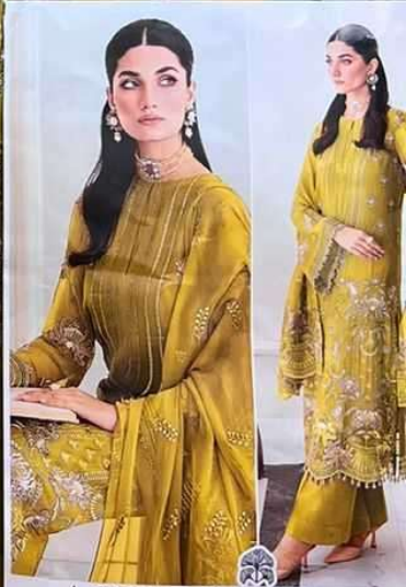
Aabidah VOL1 TOP: Embroidery with hand work (Cut: 2.5 Mtr.) ZAHA D.No BOTTOM-INNER (Cut: 2.5 Mtr.)