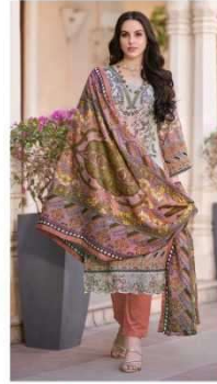
● 534-003 ●