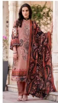
● 534-006 ●