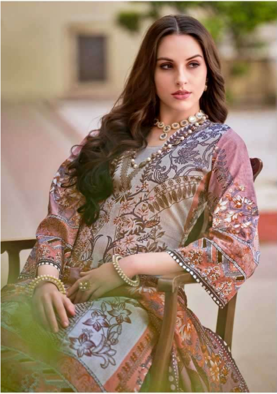
● 534-003 ●