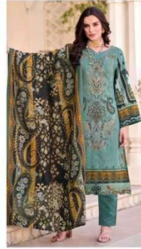
● 534-002 ●