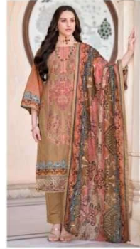
● 534-004 ●