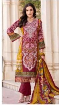
● 534-001 ●