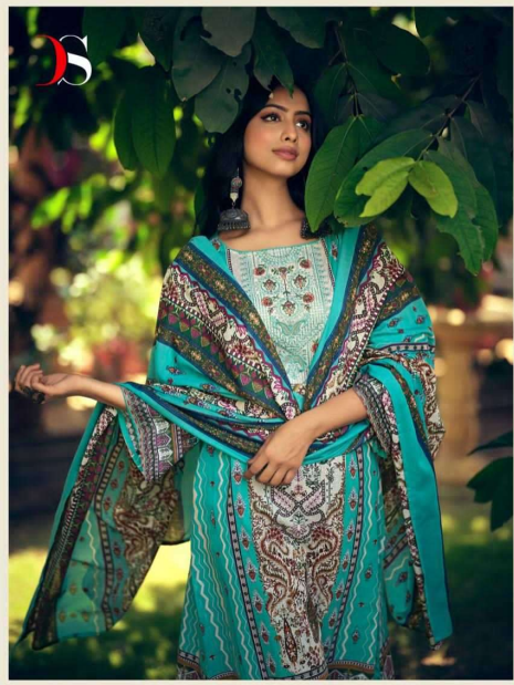
Contemporary geometric patterns