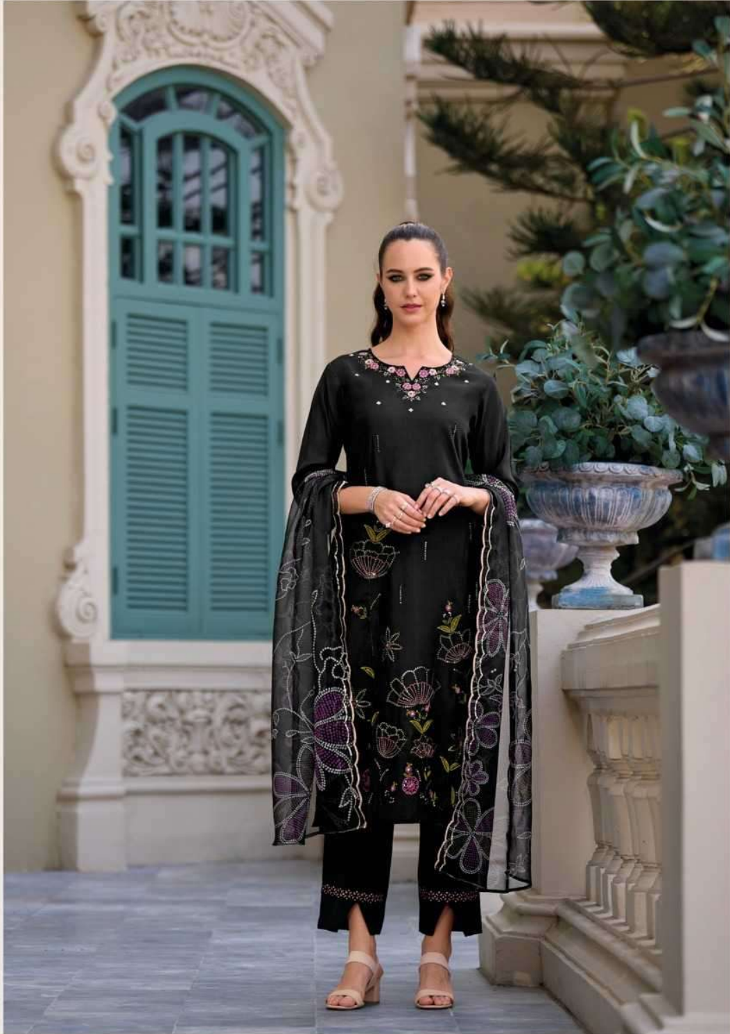
1186 Elegance is not standing out, but being remembered