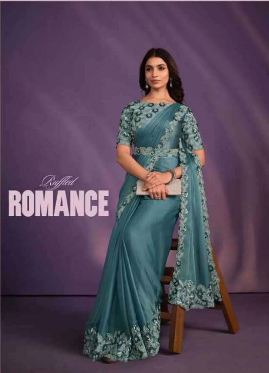
Get the magic of ruffles embarking on a journey through romance