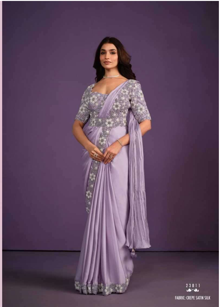
23811 FABRIC: CREPE SATIN SILK