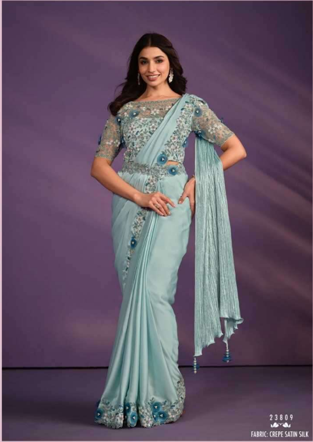
When tradition meets Innovation in every stitch of woven designs