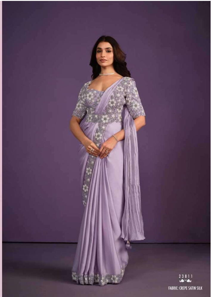
23811 FABRIC: CREPE SATIN SILK