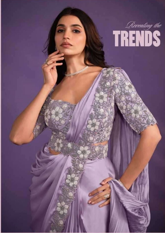
A Fashion Odyssey into the Pulse of Contemporary trends