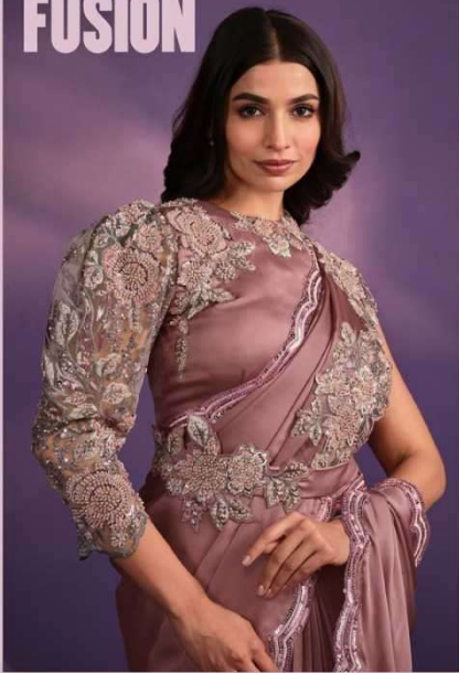
A Femme Fatale's journey through irresistible style dynamics