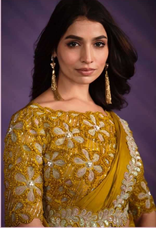
A luxurious affair of opulence, design, and desired splendor