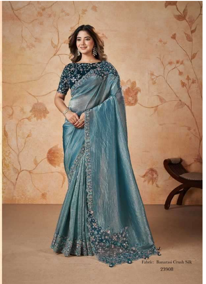
Fabric: Banarasi Crush Silk 23908