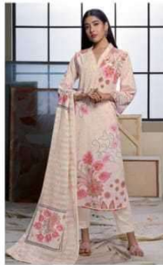
- 777 -