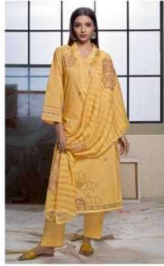
- 739 -