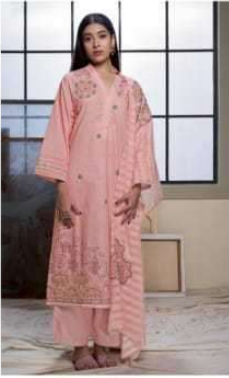
- 743 -