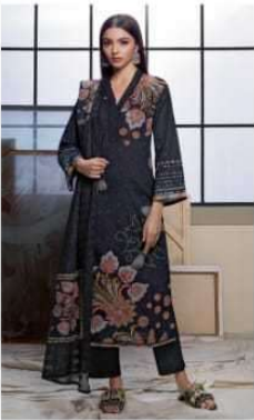
- 756 -