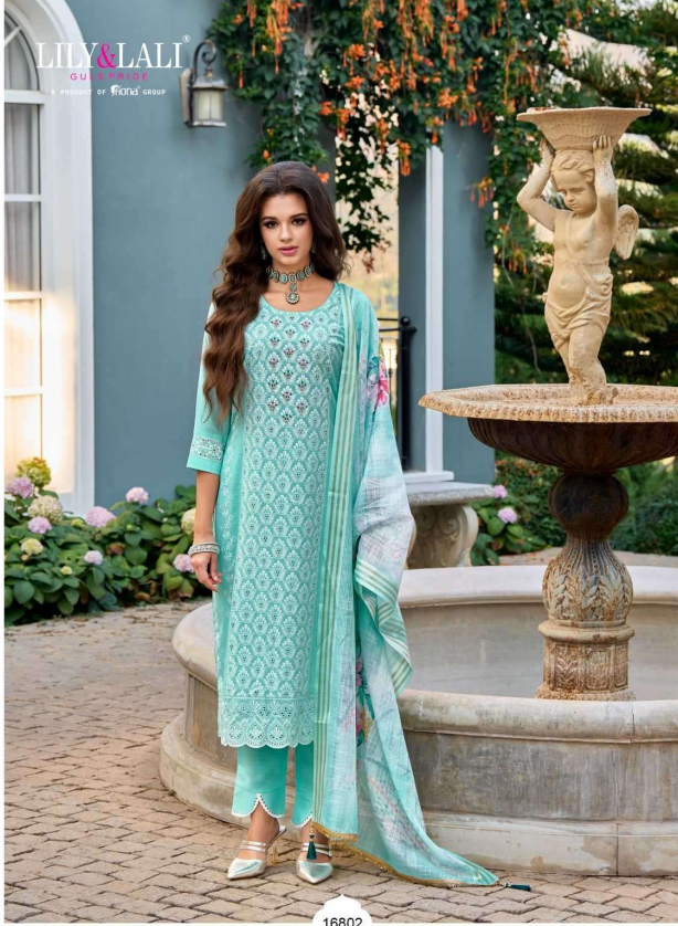
THE MODERN Eachantress