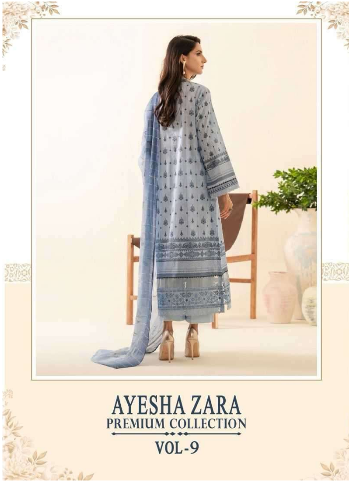
AYESHA ZARA PREMIUM COLLECTION VOL-9