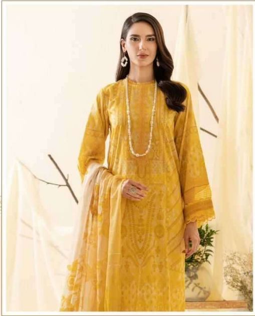
AYESHA ZARA PREMIUM COLLECTION VOL-9