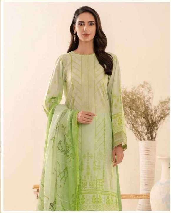
AYESHA ZARA PREMIUM COLLECTION VOL-9