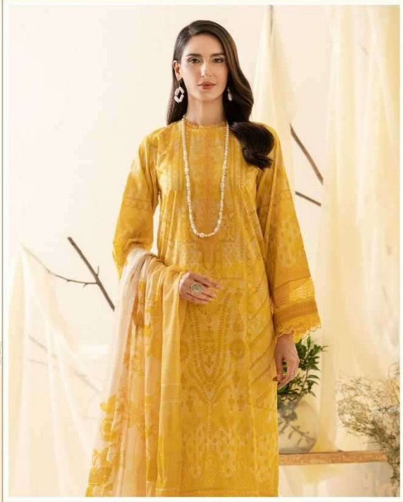
AYESHA ZARA PREMIUM COLLECTION VOL-9