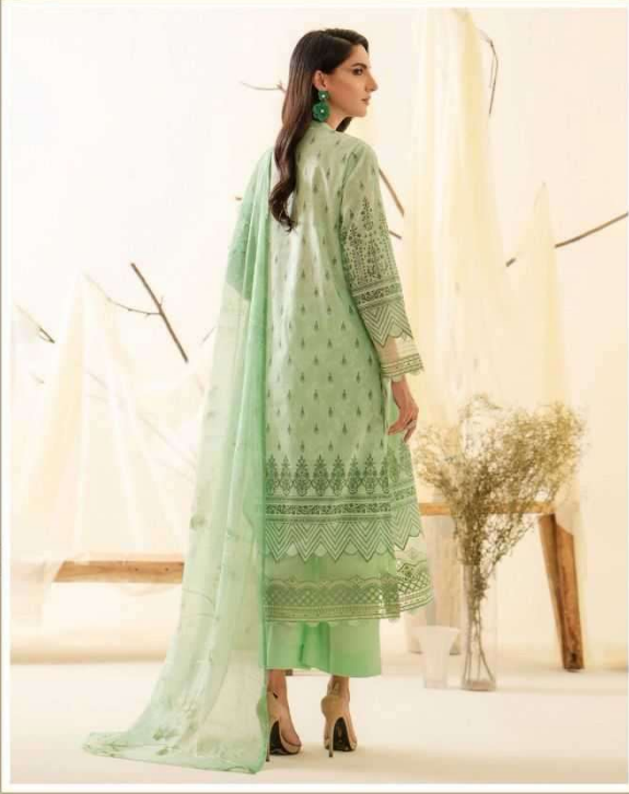
AYESHA ZARA PREMIUM COLLECTION VOL-9