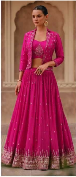
CODE - 5391