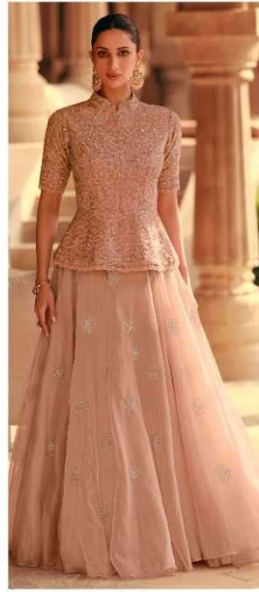
CODE - 5393