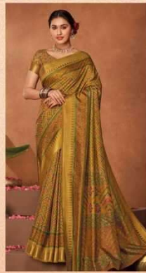
◆ 81216 ◆