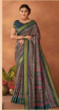
◆ 81210 ◆