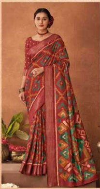
◆ 81213 ◆