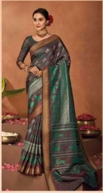
◆ 81208 ◆