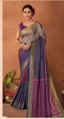
◆ 81211 ◆