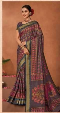
◆ 81217 ◆