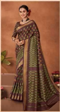
◆ 81214 ◆