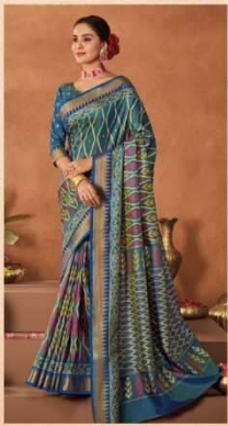
◆ 81215 ◆