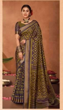
◆ 81212 ◆