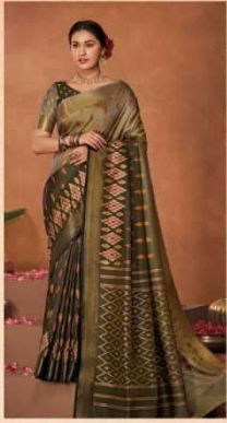
◆ 81209 ◆