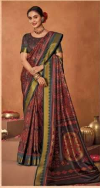
◆ 81207 ◆