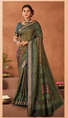
◆ 81218 ◆