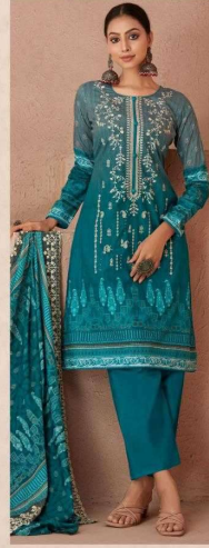
- 29004 -