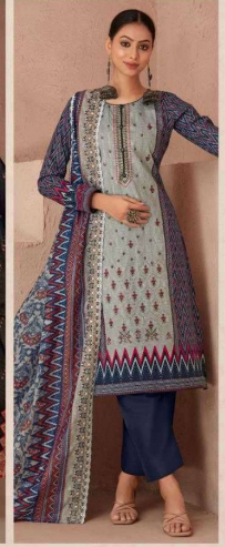
- 29006 -