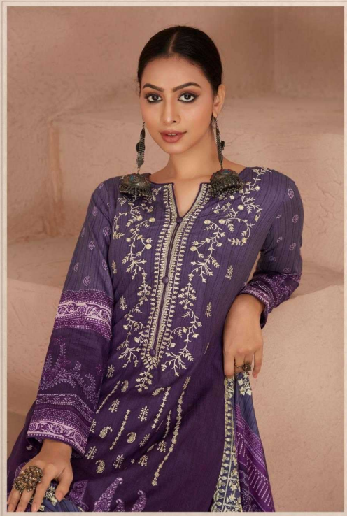
29001 Ultimate collection A dress is a wearable canvas, expressing artistry through fabric, design, and cultural nuances, symbolizing individuality and creativity.