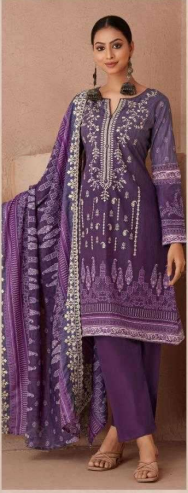
- 29001 -