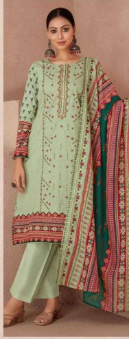
- 29003 -