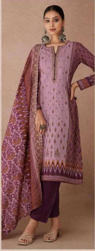
- 29002 -