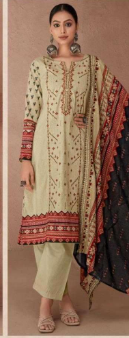
- 29005 -