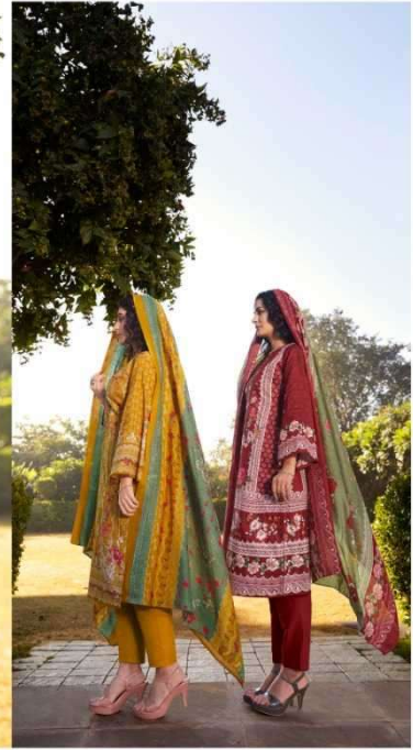
Remains a mystery