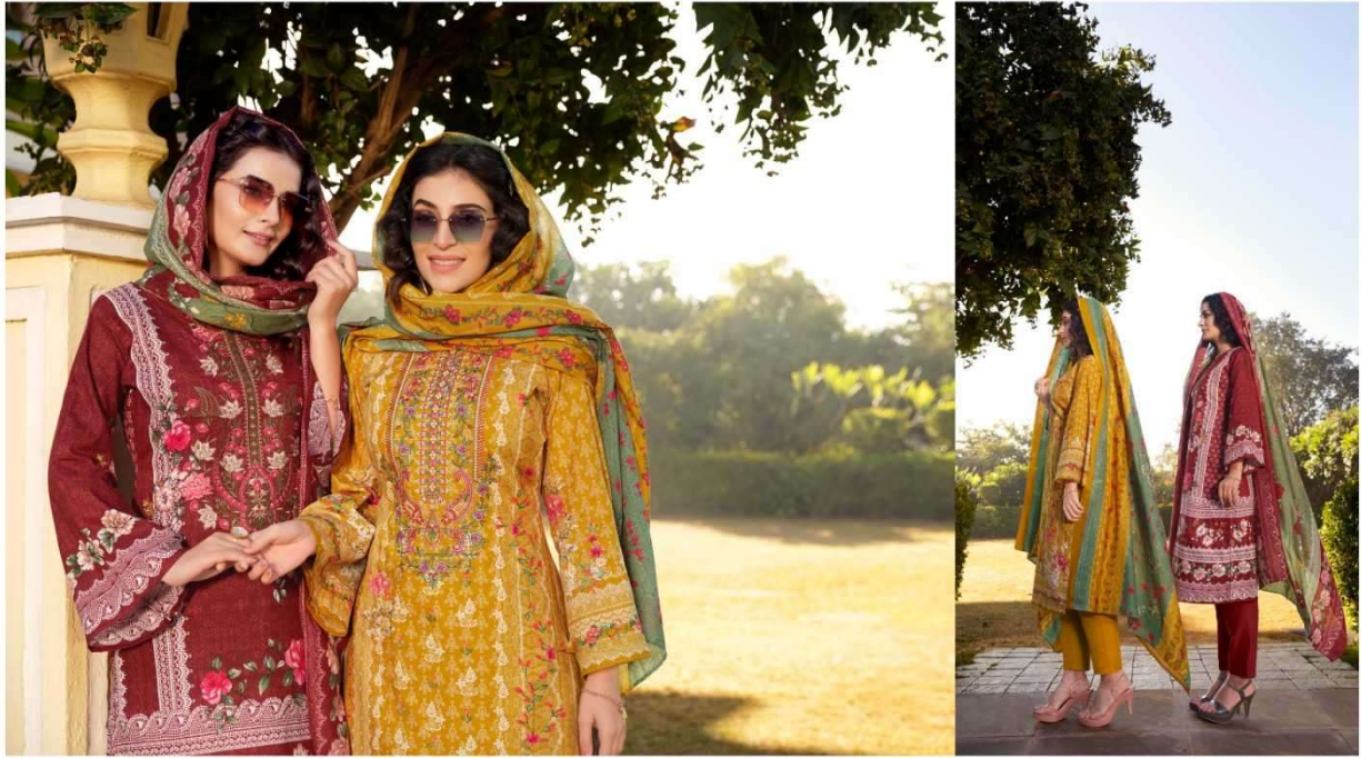
Remains a mystery