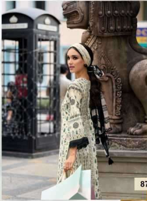
Her soul is a kaleidoscope baring with every shade and hue but shift your gaze ever so slightly and side's something entirely new....