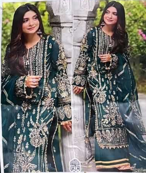
EMAAN ADEEL VOL-3 with mirror Faux Georgette with Embroidery (Cut-2.5 Mtr) ZAHARA D.No.10224-B BOTTOM-INNER with mirror Faux Georgette with Embroidery (Cut-2.5 Mtr) DUPATTA Faux Georgette with Embroidery (Cut-2.5 Mtr)