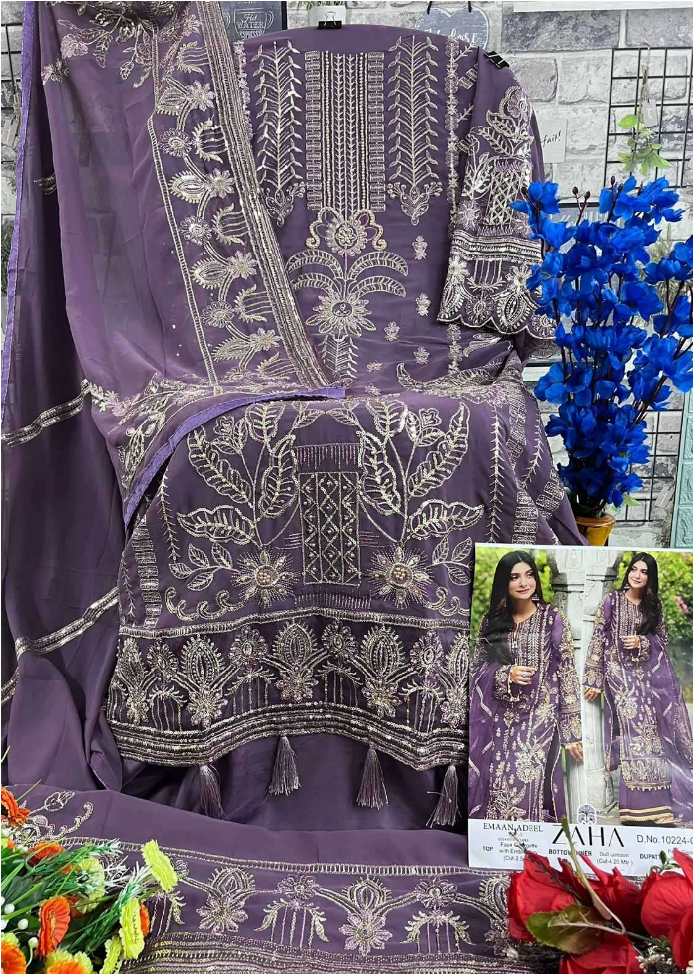
EMAAN ADEEL 10224-010000 Faux Georgette with Embroidery (Cut-2.5 Mtr) ZAHA D.No.10224-C TOP BOTTOM PANNER Dual santoon (Cut-4.20 Mtr) DUPAT