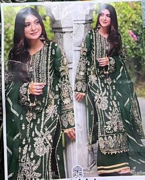
EMAAN ADEEL ZAHA D.No.10224-D TOP Faux Georgette with Embroidery (Cut-2.5 Mtr) BOTTOM INNER Dull santoon (Cut-4.20 Mtr) DUPATTA Faux Georgette with Embroidery (Cut-2.5 Mtr)