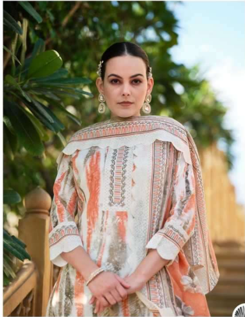
"What you wear is how you present yourself to the world, especially today, when human contacts are so quick. Fashion is natural language."