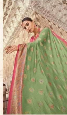
69207 (Exclusive Fall)