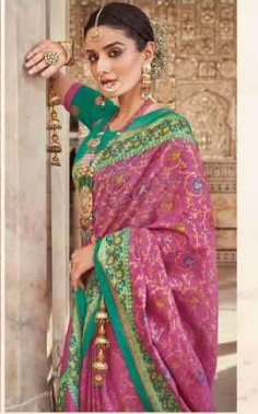
69209 (Exclusive Fall)