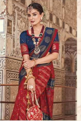
69206 (Exclusive Fall)