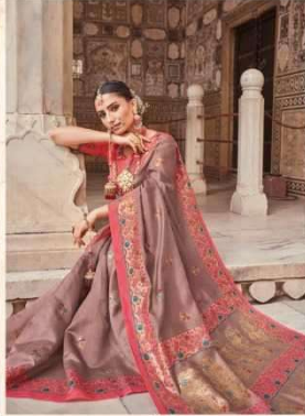
69204 (Exclusive Fall)