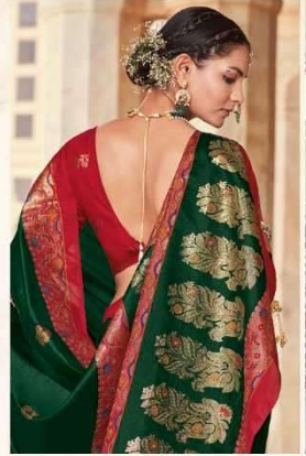
69205 (Exclusive Fall)