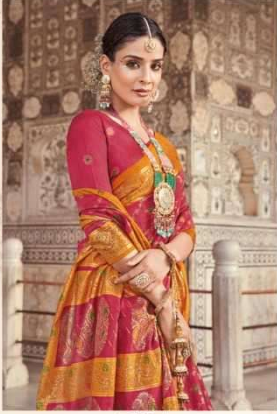
69201 (Exclusive Fall)