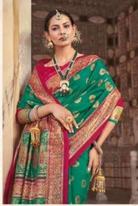
69202 (Exclusive Fall)