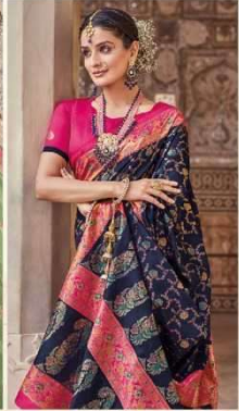
69208 (Exclusive Fall)