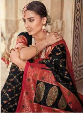
69203 (Exclusive Fall)