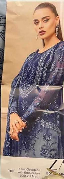
TOP Faux Georgette with Embroidery (Cut-2.5 Mtr)