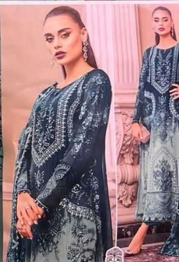
ZAHA D.No TOP Faux Georgette with Embroidery (Cut-2.5 Mtr) BOTTOM-INNER Dull satin (Cut-4.2 Mtr) DUP