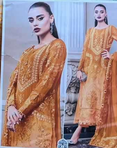
ZAHN D.No.10229 TOP Faux Georgette with Embroidery (Cut-2-5 Mtr) BOTTOM: Faux Georgette with Embroidery (Cut-2-5 Mtr) DUPATTA with Embroidery (Cut-2-5 Mtr)