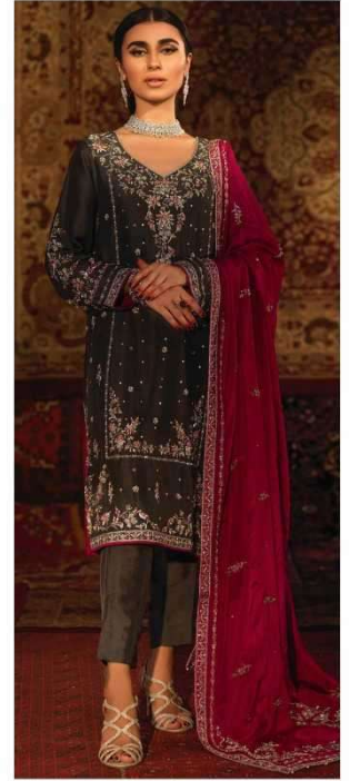
D.NO. - 7003