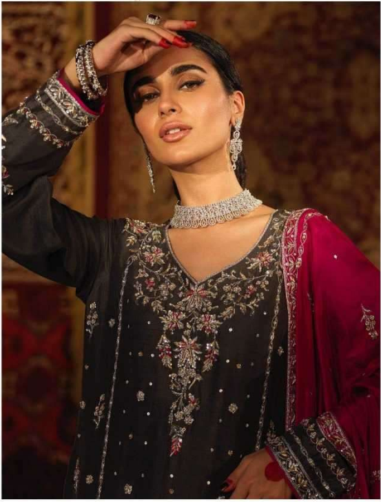
D.NO. - 7003