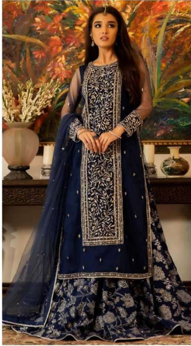
D.NO. - 7001