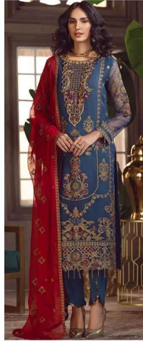
D.NO. - 7002