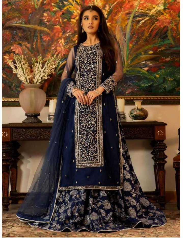
D.NO. - 7001