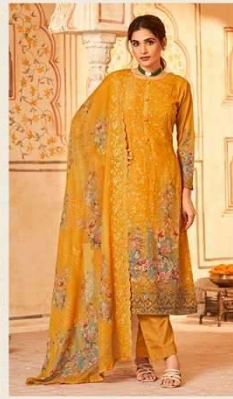
Code = 3002