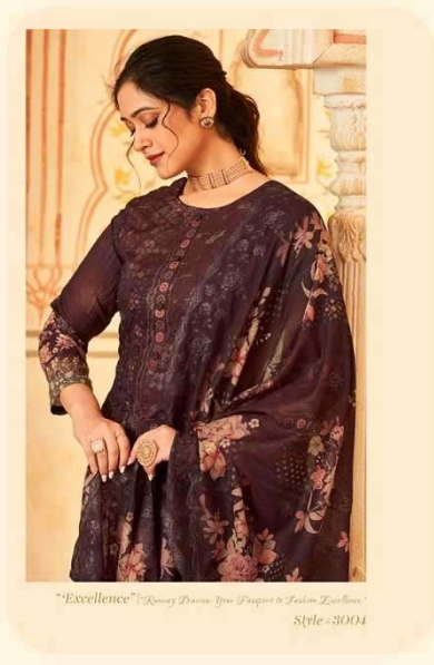
"Excellence" | Ready To Wear | Your Passport to Fashion Excellence | Style - 3004