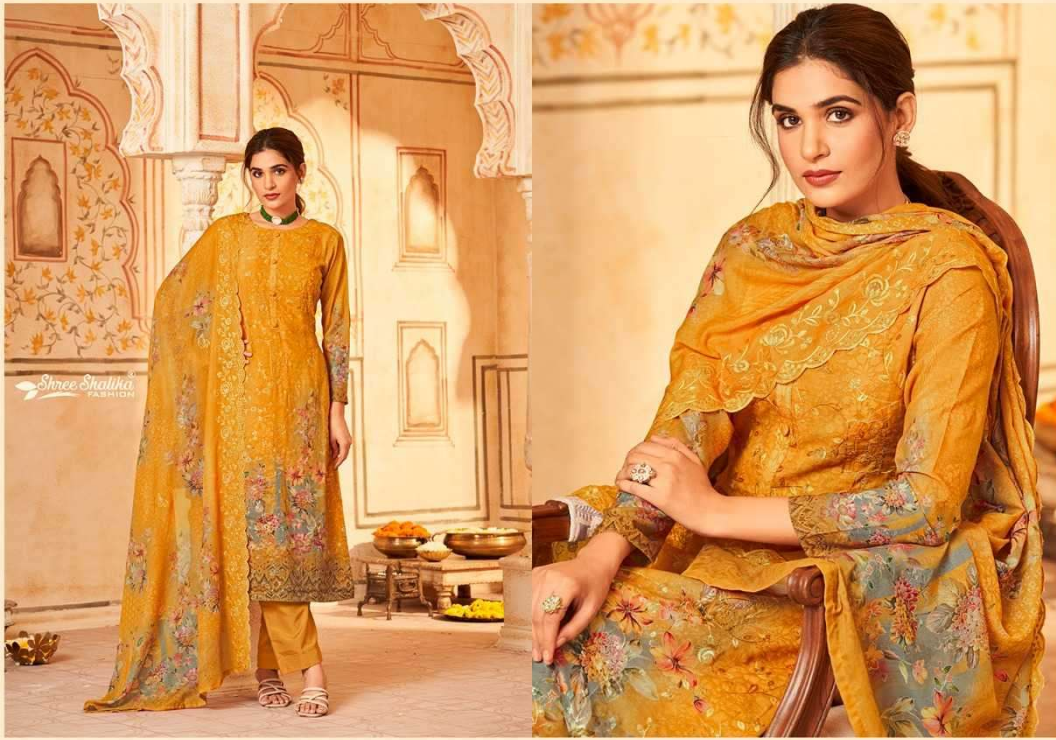
"Fashion" is the desire of style with our curated selection of finest quality designs. Style: 3002