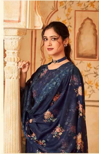
"Fashion" Dive into the ocean of style with our curated selection of award-grade designs. Style - 3008