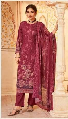
Code = 3001