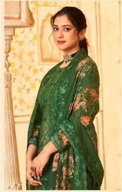
"culture fashion" (inspired by the extraordinary in everyday) Style - 3003