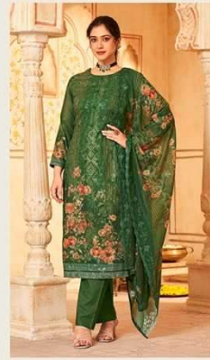
Code = 3003