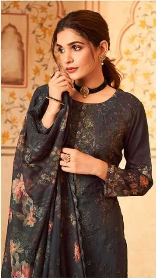
"Artistry" | Beyond Style, Exploring the Artistry of Fashion. Style - 3005