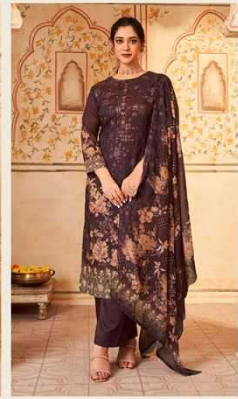
Code = 3004