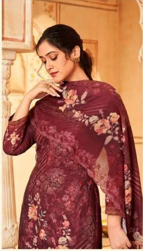
"Designs" Explore the beauty of cutting-edge designs and effortless cool in our latest lineup. Style - 3007