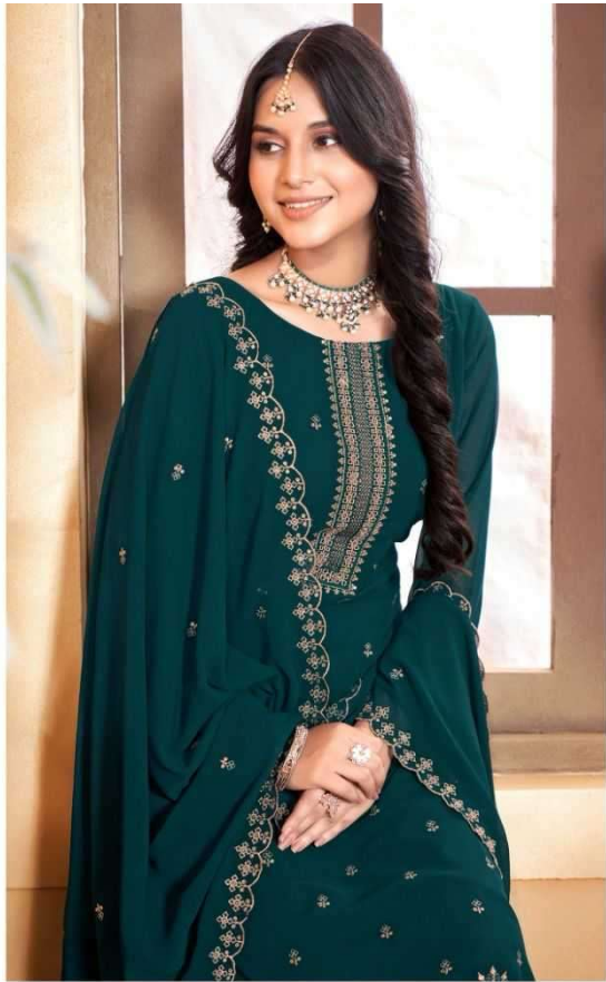
ALL GIRLS ARE GORGEOUS. JUST LIKE YOU