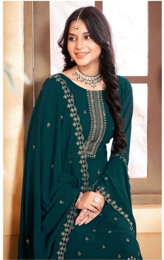
ALL GIRLS ARE GORGEOUS. JUST LIKE YOU