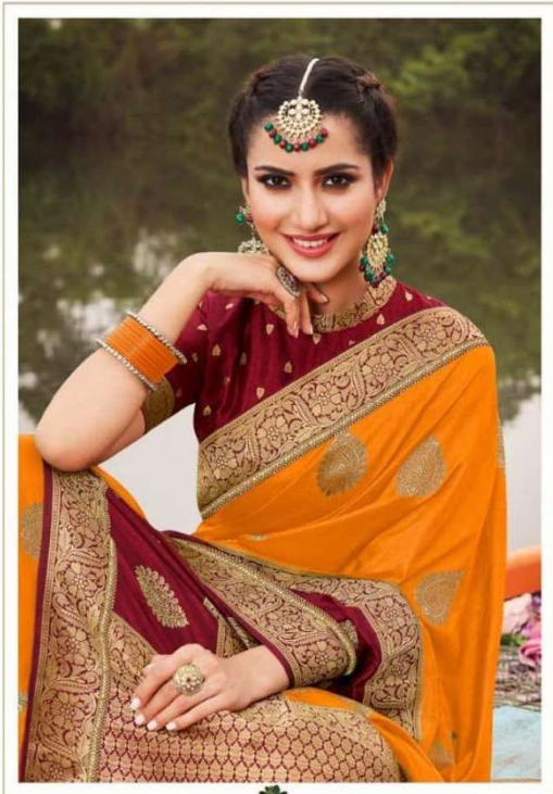
The glimmer is something which will fulfill all the requirement for glossy & trendy look.