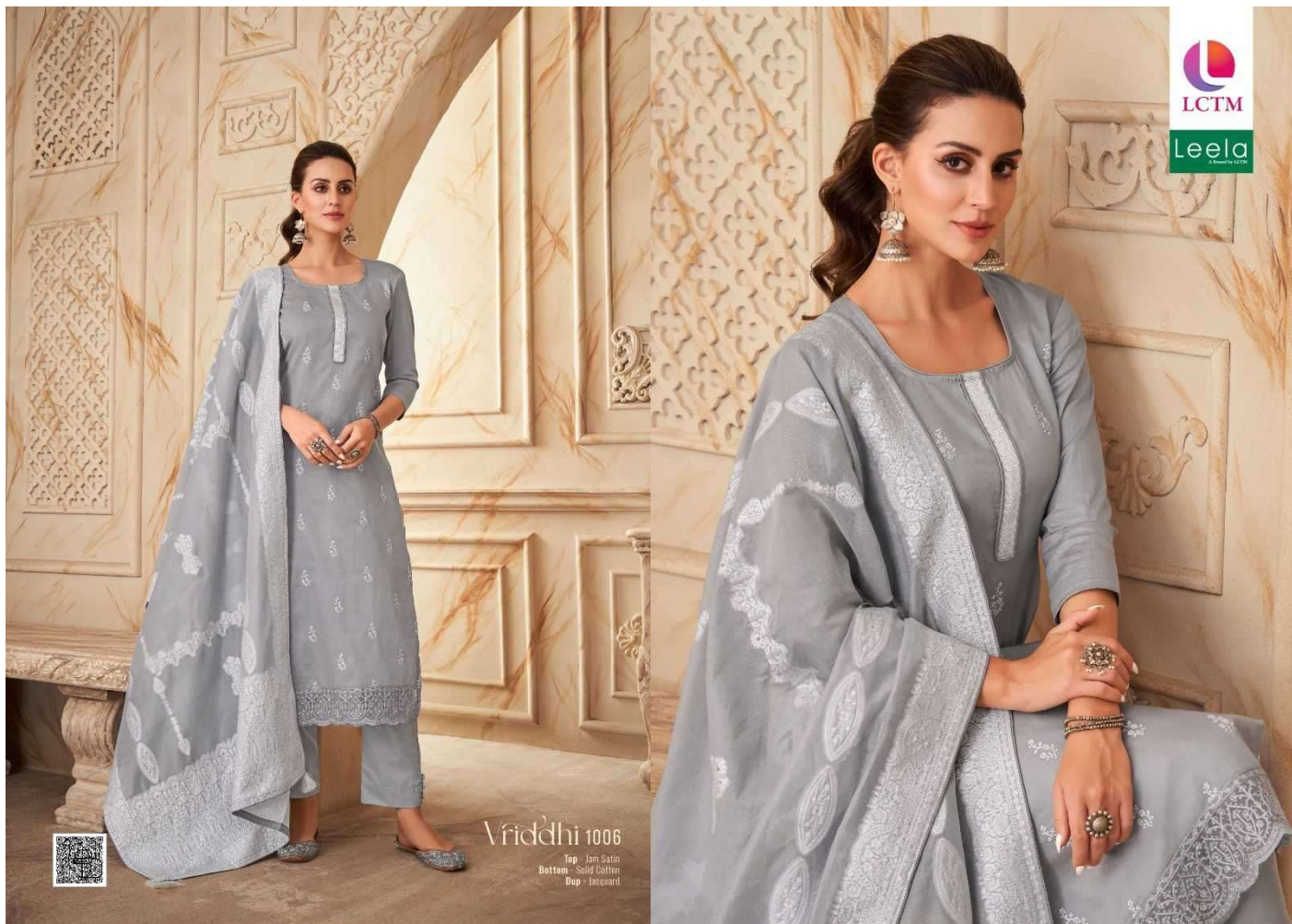
Vrid'dhi 1006 Top - Jam Sain Bottom - Solid Cotton Dup - Jacquard