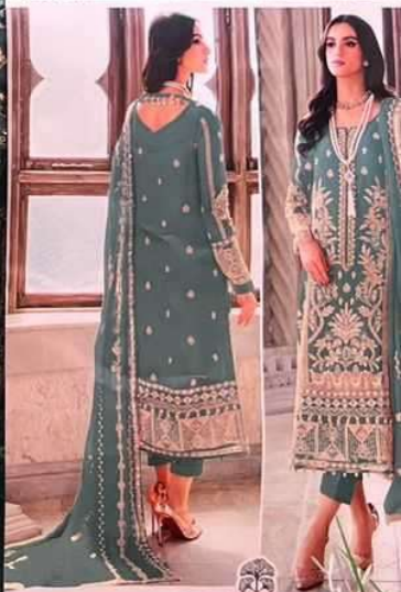
GULAAL 100% Faux Georgette with Embroidery ZAHARA DUAL LAYER TOP BOTTOM-INNER Dual Layer