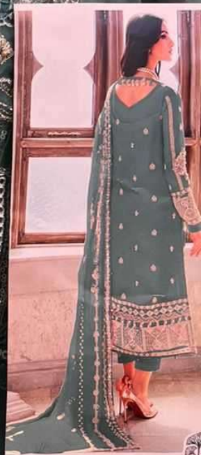
GULAAL SIZES 2 BLENDED WITH COTTON TOP: Faux Georgette with Embroidery BOTTOM-INNER