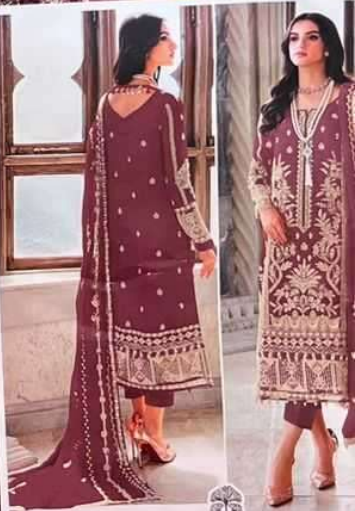
GULAAL D.No TOP Faux Georgette with Embroidery ZAHA BOTTOM-INNER DUFA