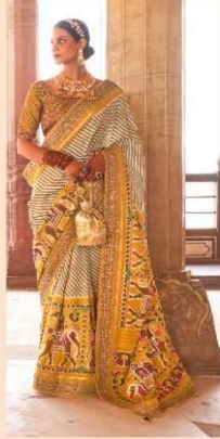
R-108 C (EMB-BR-BP)