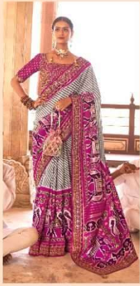
R-108 A (EMB-BR-BP)