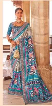
R-108 D (EMB-BR-BP)