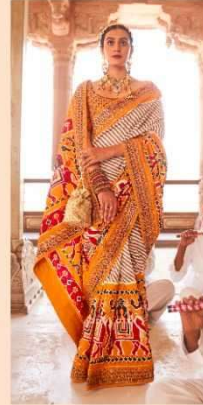
R-108 G (EMB-BR-BP)