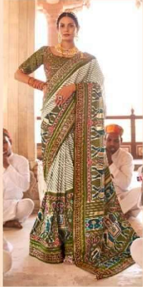
R-108 B (EMB-BR-BP)