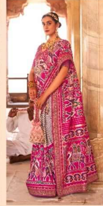
R-108 I (EMB-BR-BP)