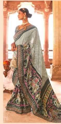
R-108 E (EMB-BR-BP)