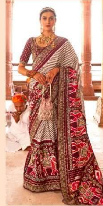
R-108 F (EMB-BR-BP)