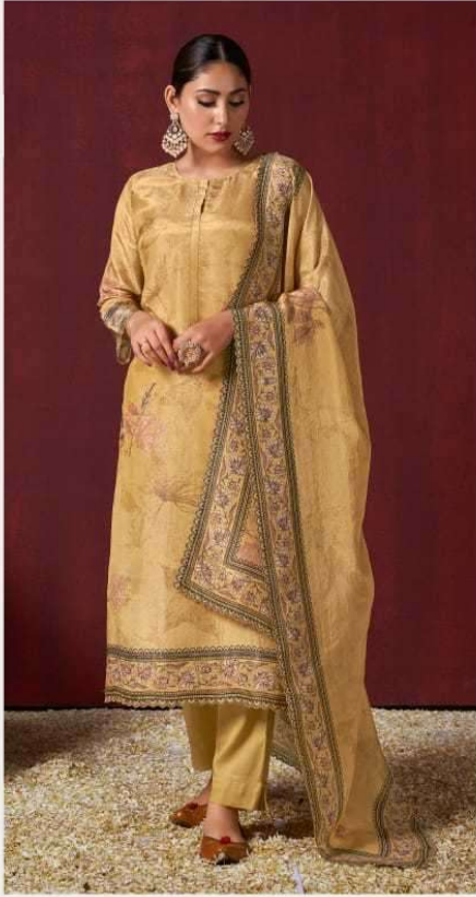
3 7 8 A