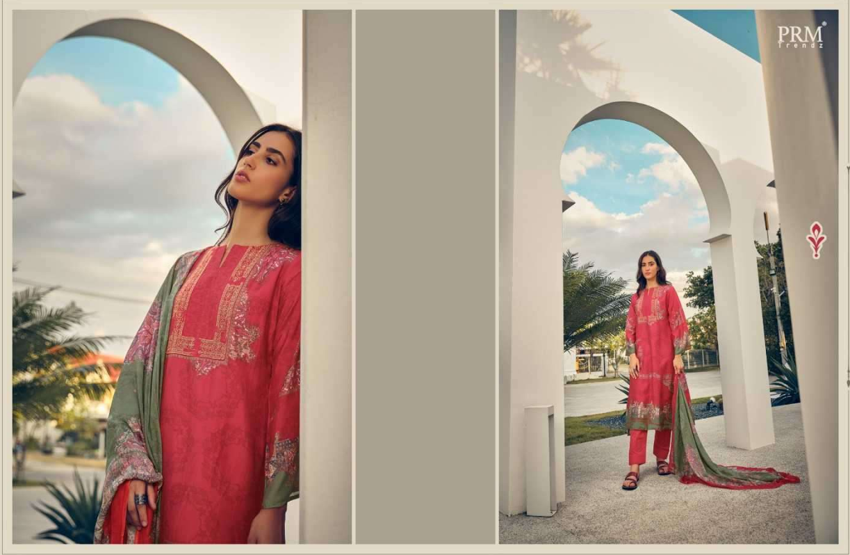
Indulge in the lavish prints to flaunt your gorgeous ethnic style this season; be phenomenal. → ← → ← 5411