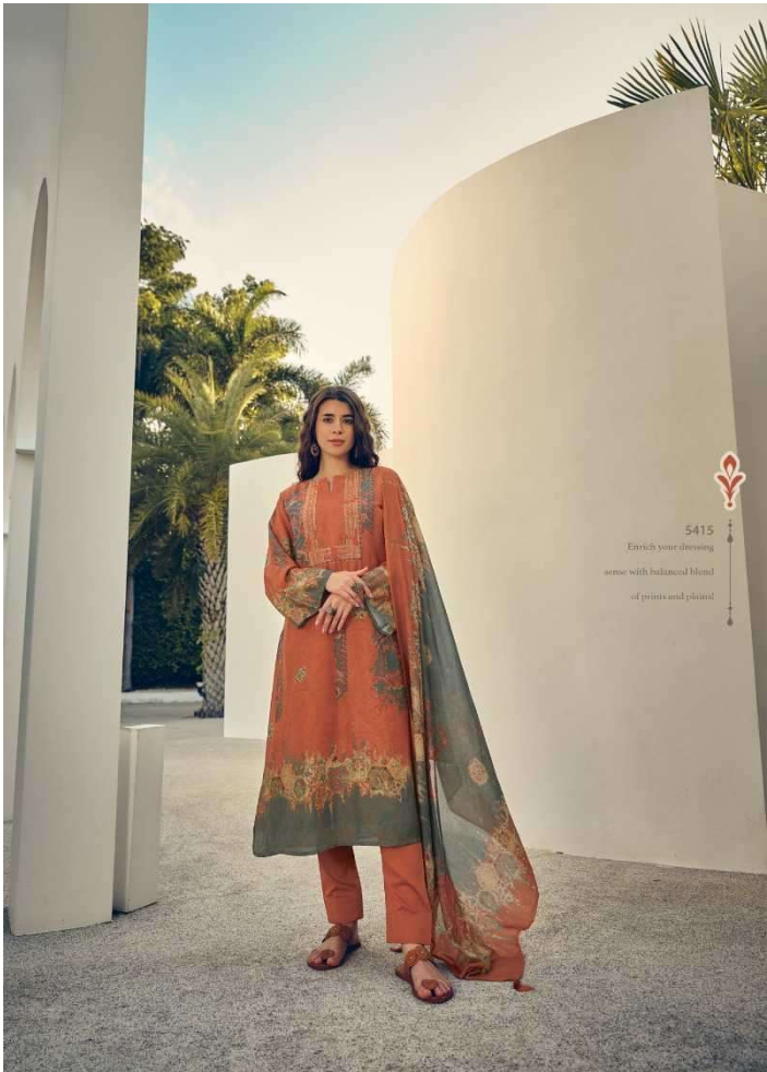
5415 Enrich your dressing sense with balanced blend of prints and pleats