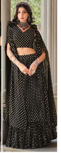
CODE | 2326