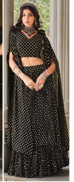
CODE | 2326