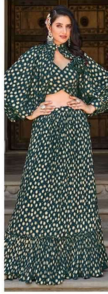
CODE | 2324