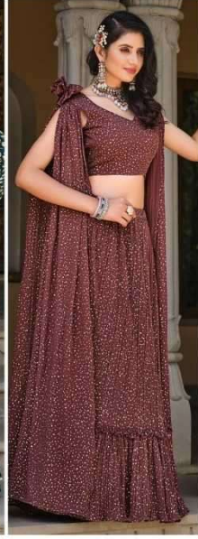
CODE | 2325