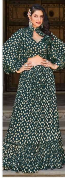
CODE | 2324