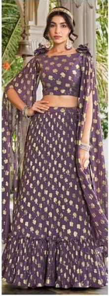
CODE | 2321