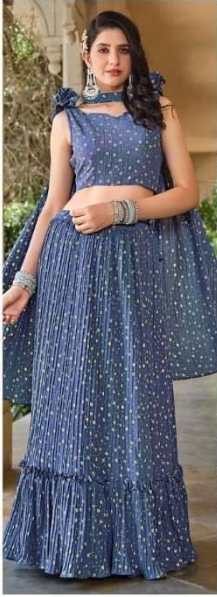
CODE | 2322