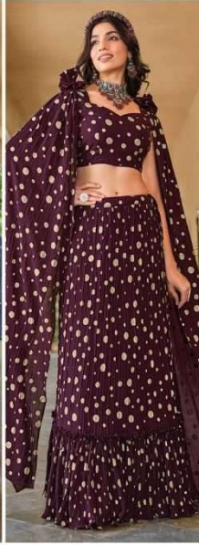
CODE | 2323