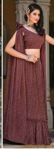
CODE | 2325