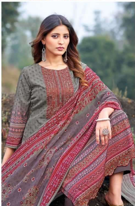
Crafted to Perfection Luxury in Every Loop: Unleash the Beauty of Bespoke