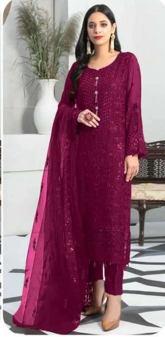
D.No | 235-C