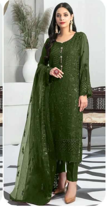
D.No | 235-D