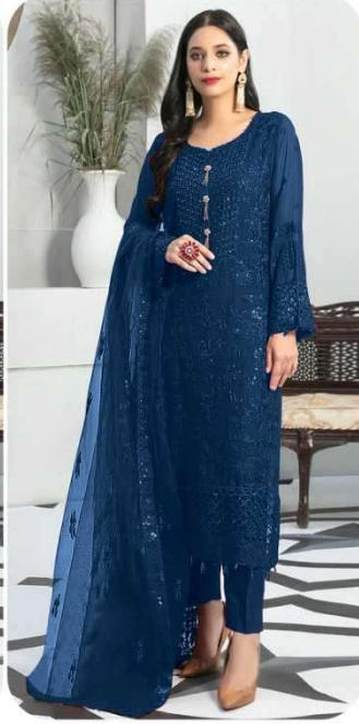
D.No | 235-B