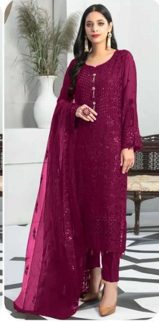
D.No | 235-C