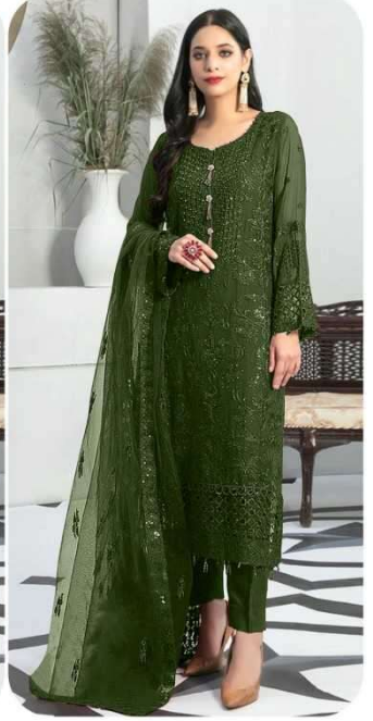
D.No | 235-D