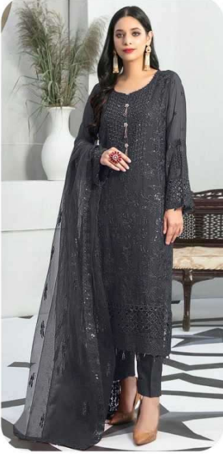
D.No | 235-A