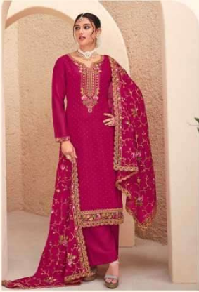
CODE | 1183