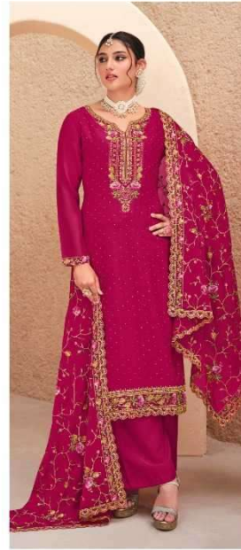
CODE | 1183