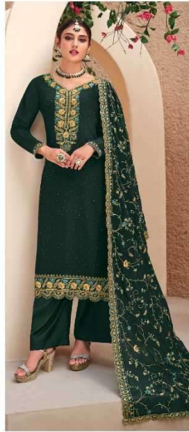
CODE | 1182