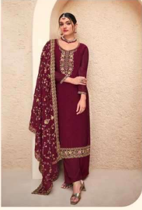
CODE | 1181