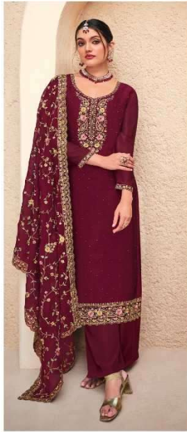
CODE | 1181