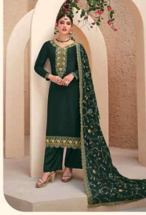
CODE | 1182