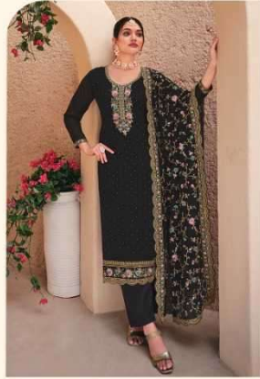
CODE | 1184