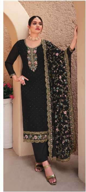
CODE | 1184