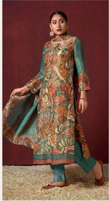
3 2 6 B