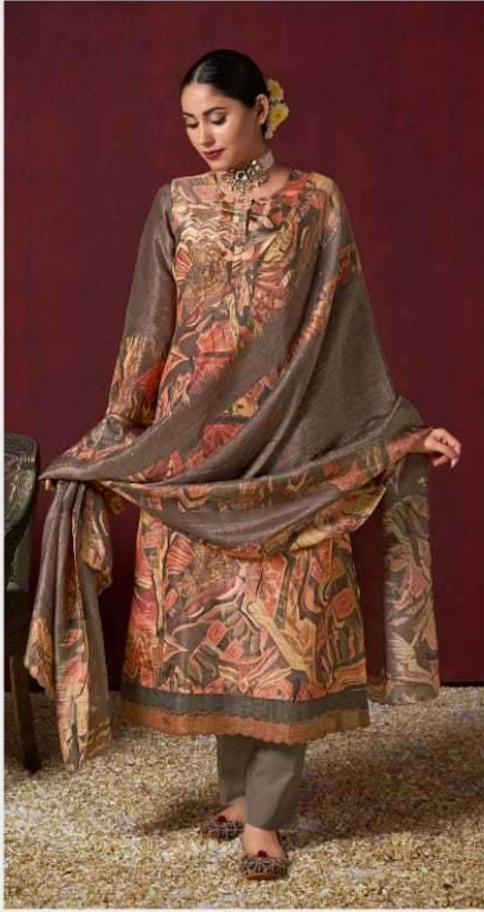
3 2 6 A