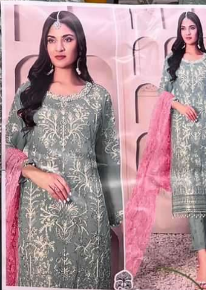
ZAHA D.No. 10 TOP Faux Georgette with Embroidery (Cut-2.5 Mtr.) BOTTOM-INNER