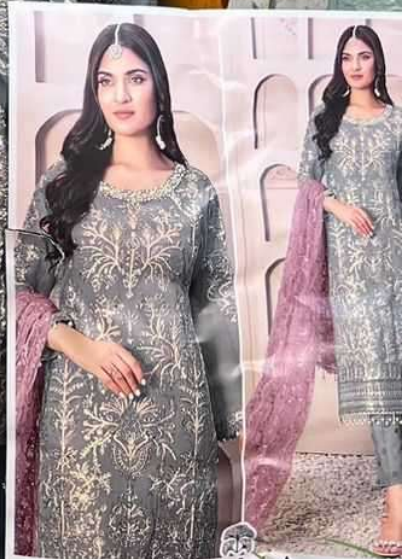
ZAHA D.No. 102 TOP Faux Georgette with Embroidery (Cut-2 & Aplr.) BOTTOM-INNER Silk (Cut-4) DUPATTA Faux with E (Cut-2)