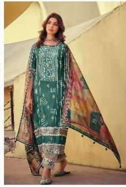
CODE | 8732