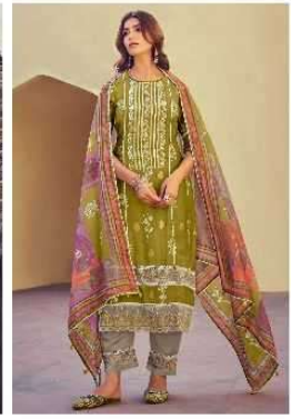
CODE | 8736