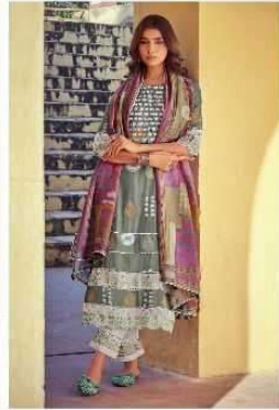
CODE | 8734