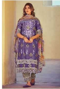
CODE | 8737