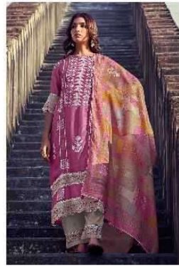
CODE | 8735