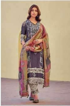
CODE | 8733