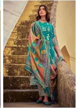
CODE | 8738