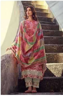
CODE | 8731