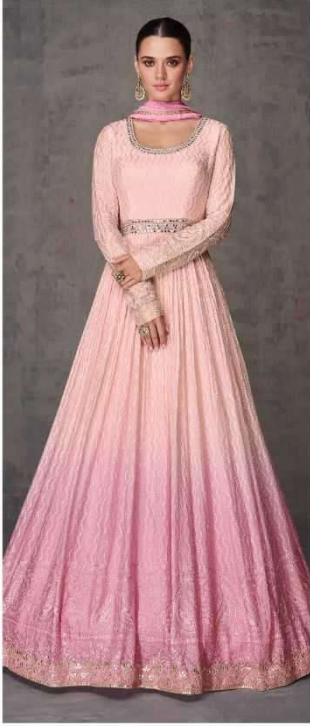
D NO : 5356