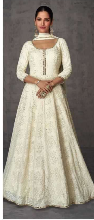
D NO : 5358