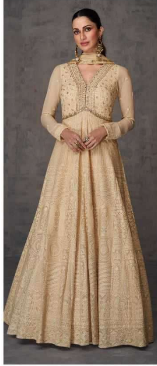
D NO : 5357