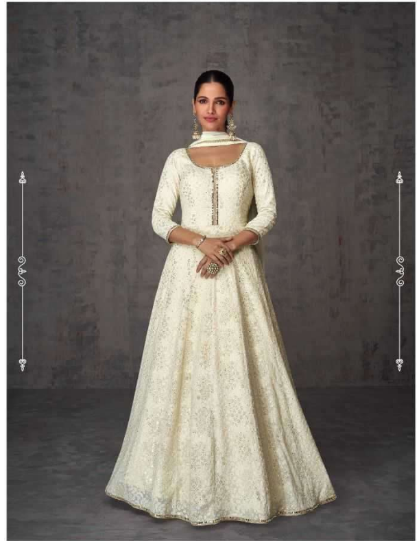
D NO : 5358