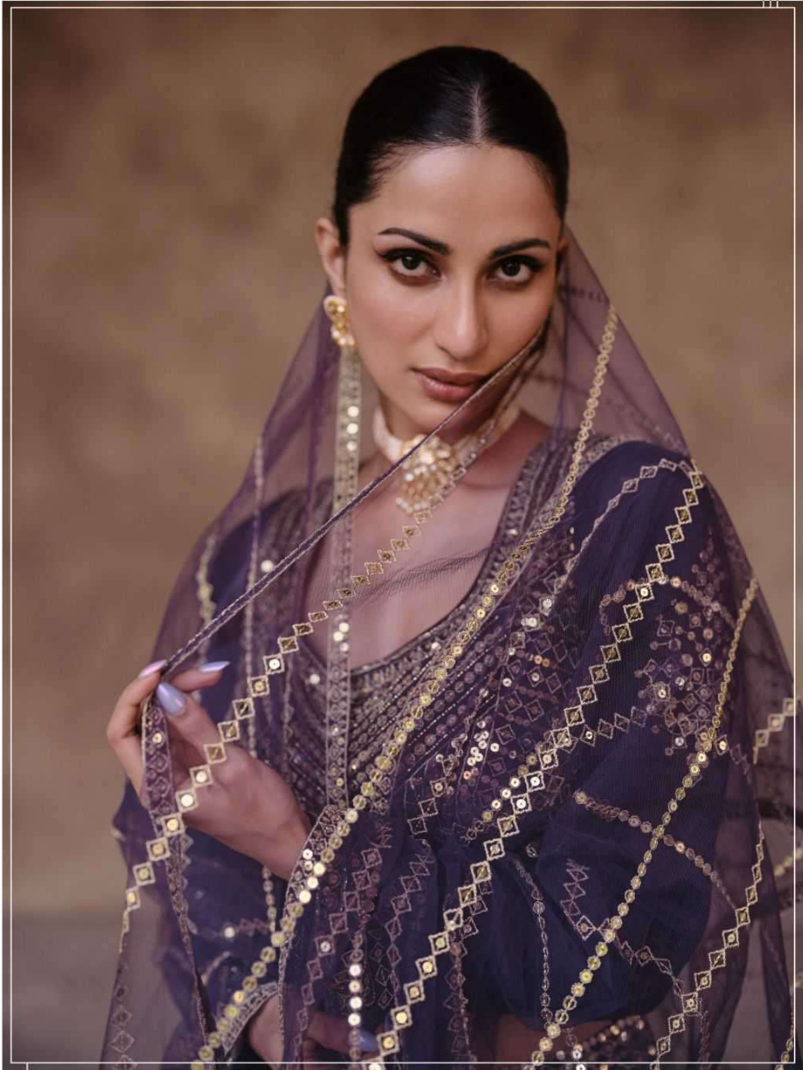
A breath taking array of fine detailing & intricate design inspired by Indian culture ..... CODE - 5394