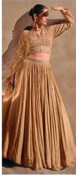
CODE - 5395