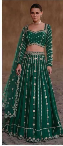
CODE - 5396