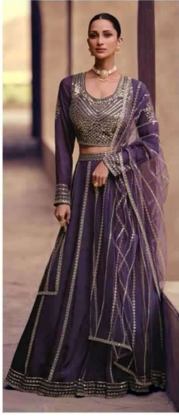
CODE - 5394