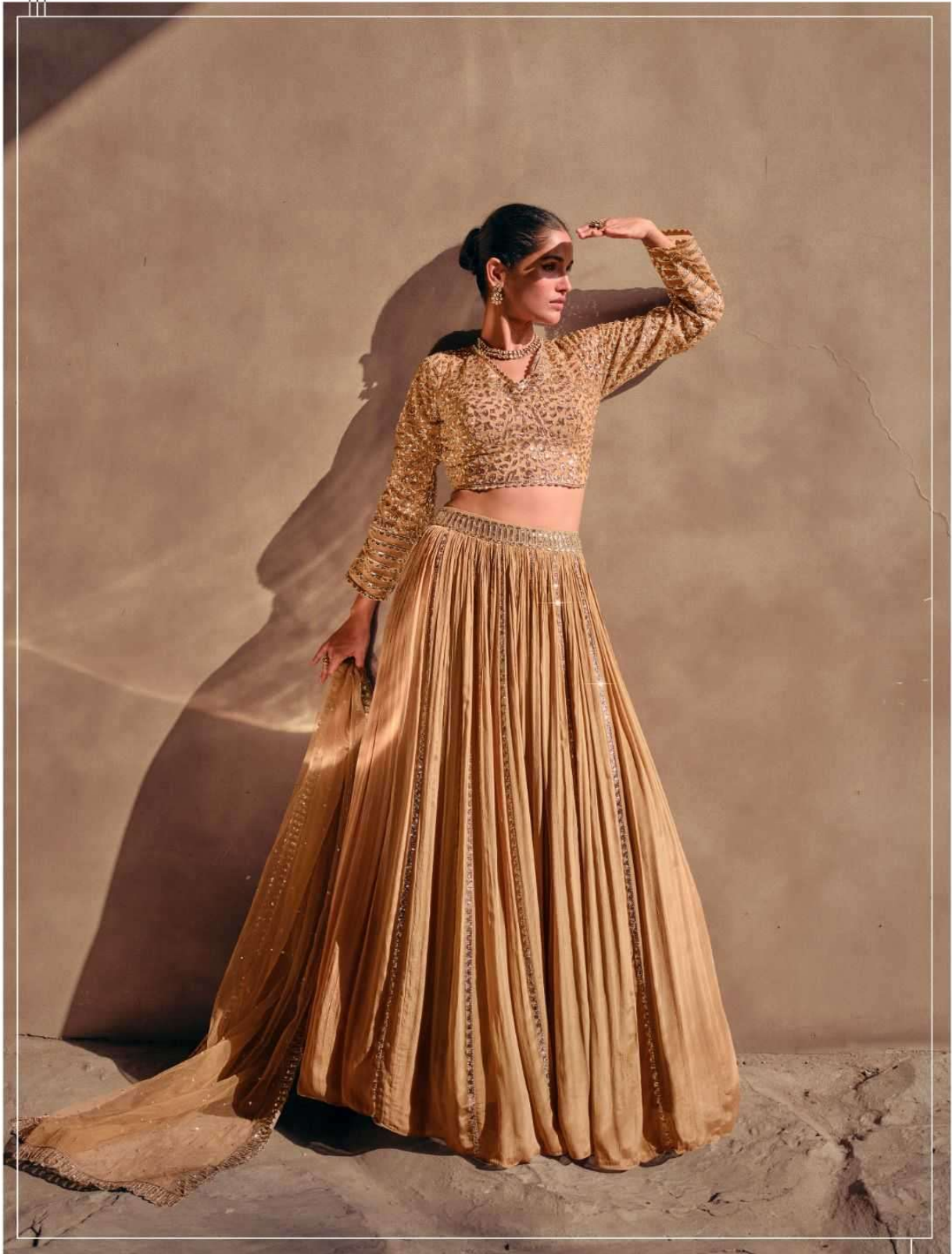
The designs were multi utility & we could see a few outfits that we could wear up with other everyday .....